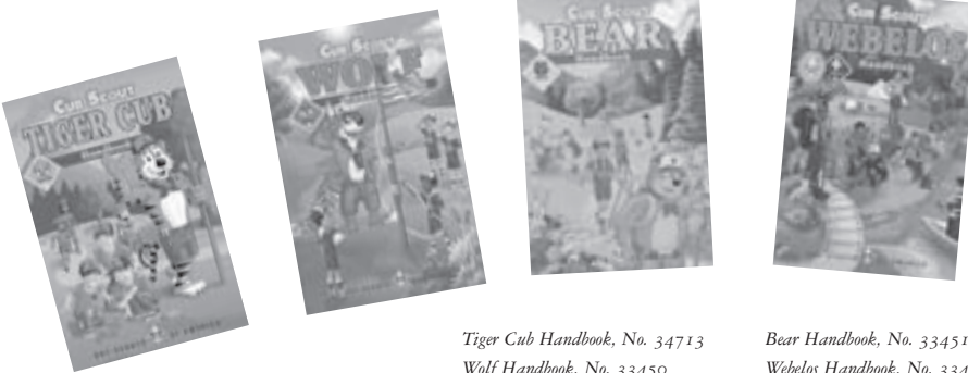
Tiger Cub Handbook, No. 34713 Wolf Handbook, No. 33450